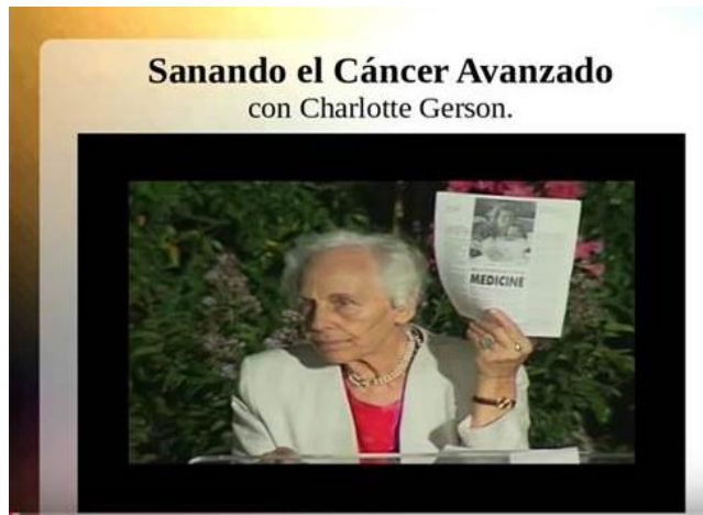
(Video Cure Advanced Cancer with The Gerson Therapy )

In addition to comments from users who support the treatment proposed and suggest it is credible, another indicator of how many people believe the content of a video is the number of 'likes' it has, which in all of the videos analysed here far outweighs the 'don't likes'.